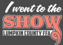
Left Chest Design